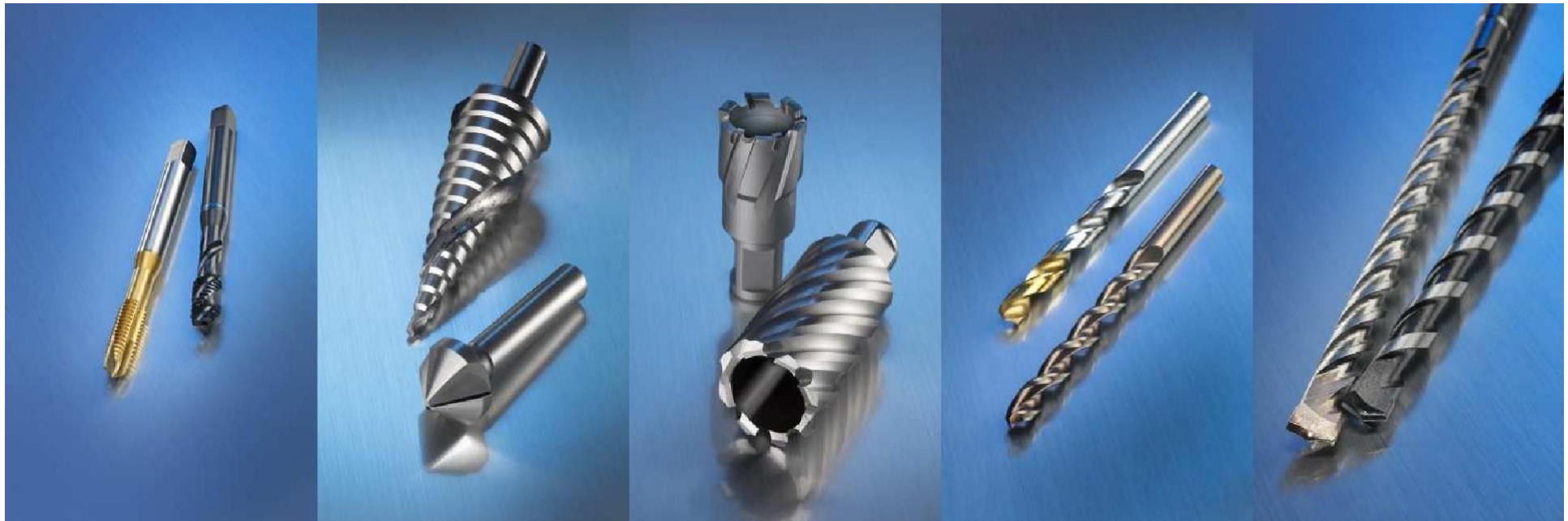
Company Presentation and Product Overview